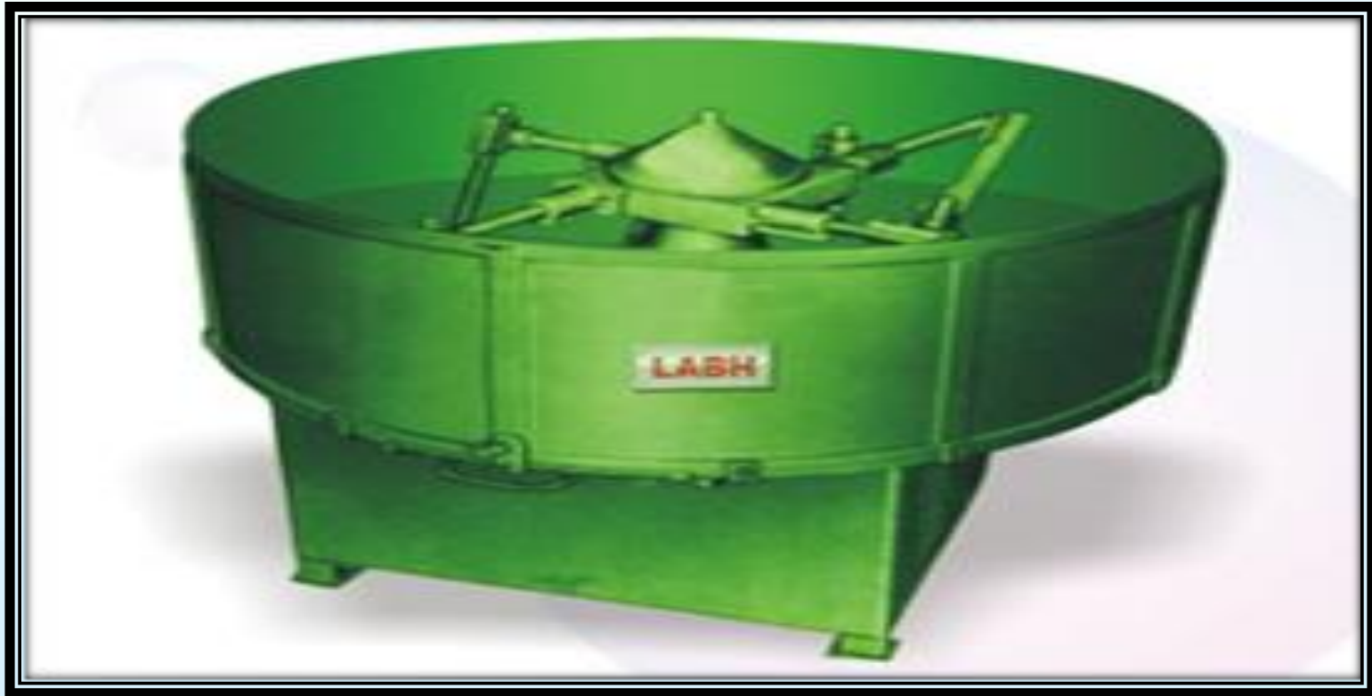
Detergent Powder Mixer Machine