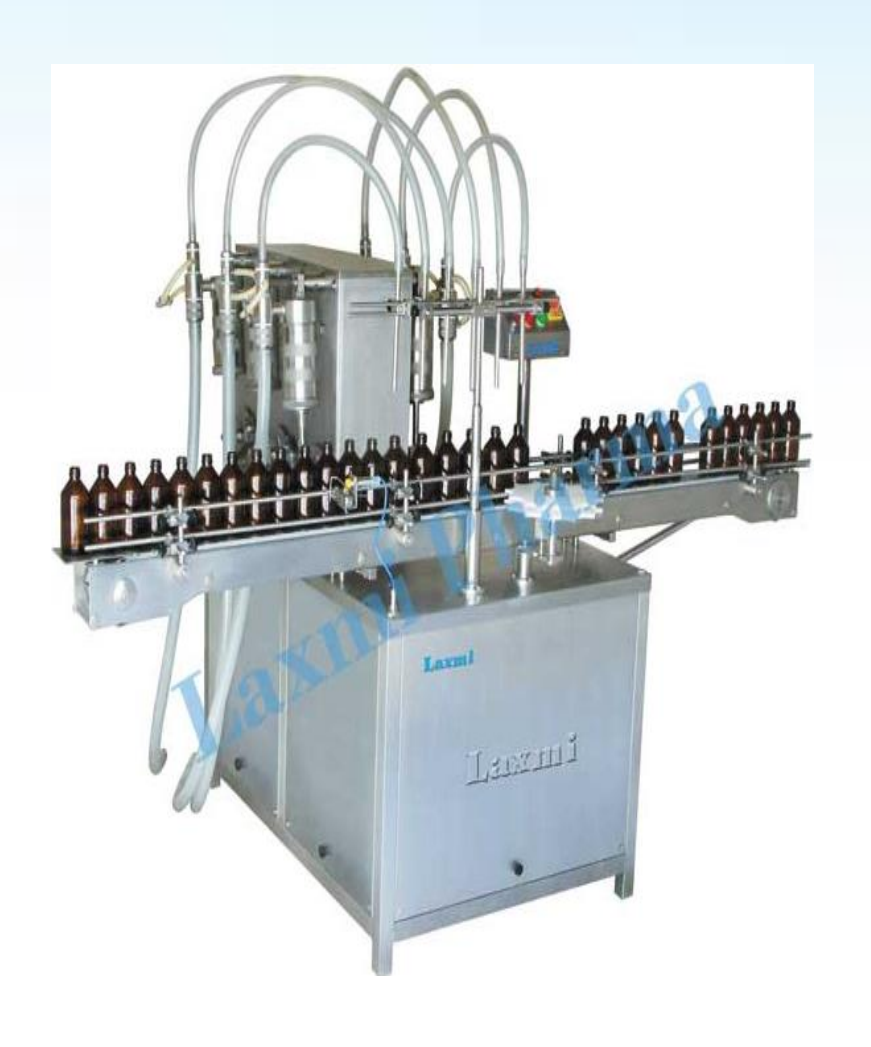
WITH CAP SEALING MACHINE