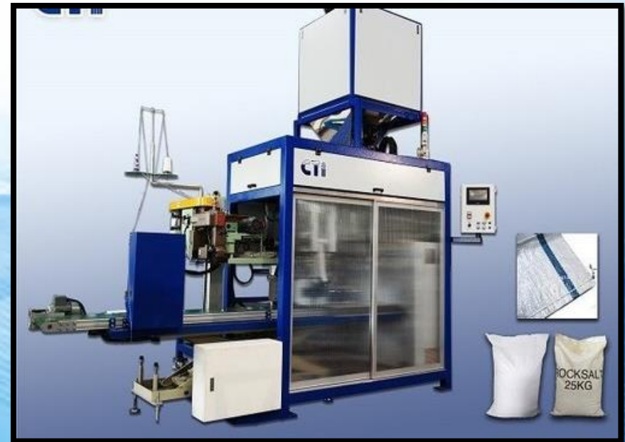
Packing & Sealing Machine