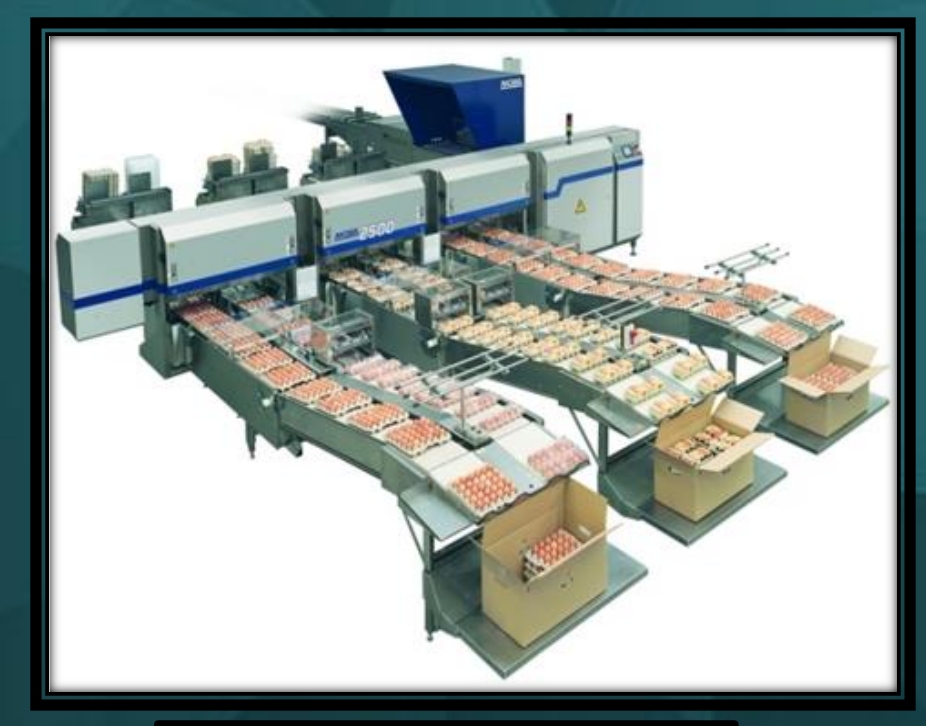
Egg Packing Machine